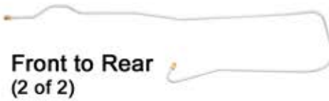
Front to Rear (2 of 2)