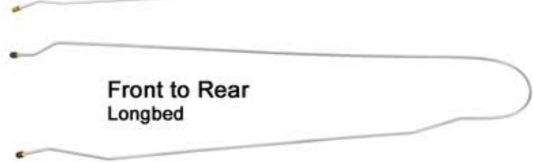
Front to Rear Longbed